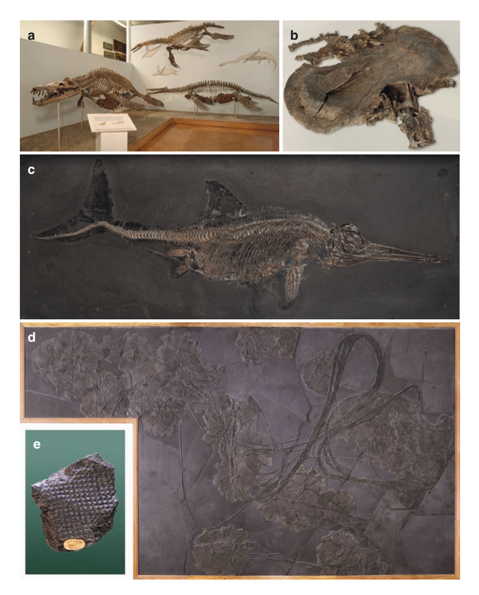
Fig. 52.2 (a) View into the marine reptile hall showing three plesiosaurs from the Middle Jurassic of Great Britain. (b) Skeleton of the turtle-like placodont Henodus chelyops from the Gipskeuper formation of Tübingen-Lustnau. (c) The ichthyosaurier Stenopterygius quadriscissus with soft tissue preservation. (d) The Jurassic sea lilie Seirocrinus subangularis , the so-called "Swabian medusa head", is related to sea urchins and starfishes. It is attached to driftwood. (e) Tree trunk imprint of the carboniferous species Sigillaria oculata . These clubmosses were up to 30-m high and their remains comprehensively contributed to the formation of coal deposits